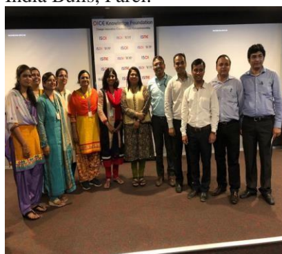
"Boot Camp" at ISDI, Parel