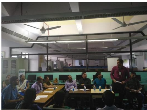
DAB Meeting September 29, 2018

Department Advisory Board meeting was held on September 29, 2018. Industry experts, Academic expert, Parents, Alumni, Students and the staff of IT have attended the meeting. Vision and mission of the college and the department have been informed to the members. Department initiatives and activities have been discussed.