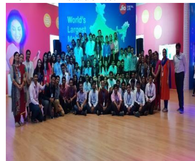
Industrial Visit "Reliance Jio Ghansoli"