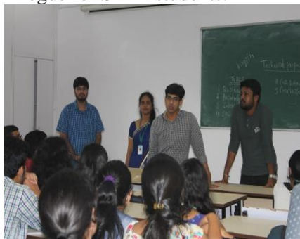
Seminar on "Soft skill and Industry Interaction"