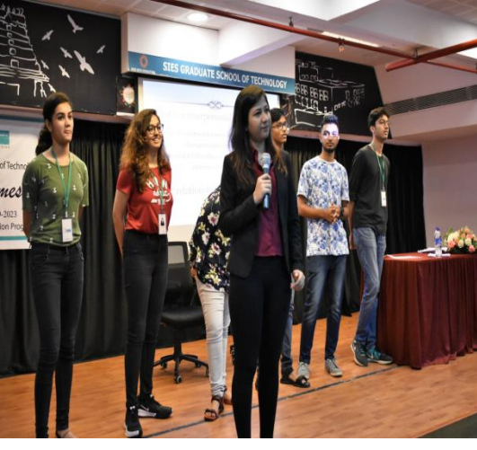
Seminar on Interpersonal Skills