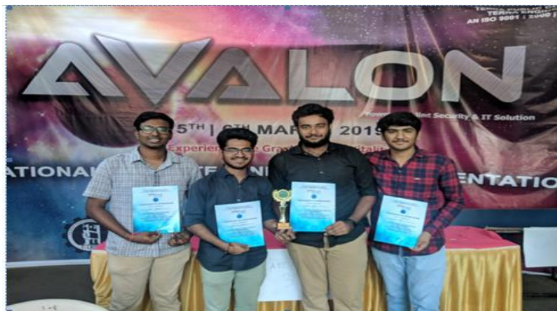
Avalon. Project Competition