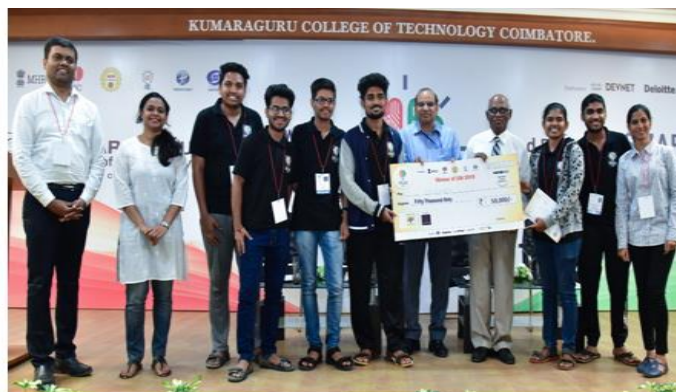
Smart India Hackthon 2019