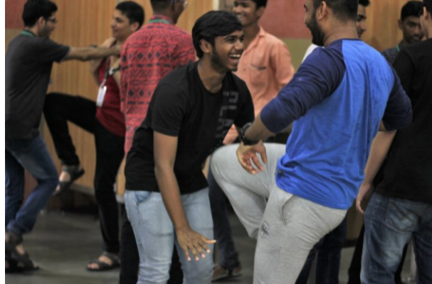
YOGA SESSION AND SELF-DEFENSE WORKSHOP CONDUCTED BY EXPERTS

Following in the footsteps of knowledge and awareness, a disaster management workshop was conducted for the first-year engineering aspirants where they were introduced to several ways of protecting themselves in a serious situation and ways to avoid fatal injuries/accidents.