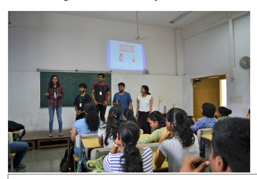
INDULGING IN CO-CURRICULAR ACTIVITIES CONDUCTED BY VARIOUS TEAMS OF THE COUNCIL

The Literary Team, had the First Years bring out the creative writers in them, the most innovative of which were called out to the dais to enact their plot with their group. The ebullient students were indulged in collective tasks which inevitably created a tumultuous yet rhythmic atmosphere in the classroom. These sessions lead the students to present and articulate on alternate endings of famous movie scripts.