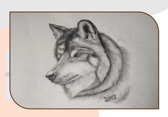
Sketch By Atharva Karnik