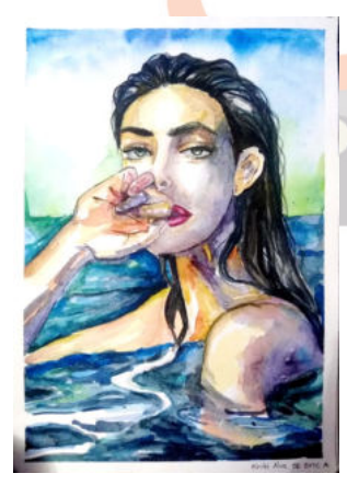
Sketch by Kriti Alva, SE EXTC A