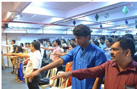
PRINCIPLES AND COMMITMENTS- PLEDGE TAKING CEREMONY

An interactive session of parents with the department HODs, class in-charges and the placement coordinator were also arranged.