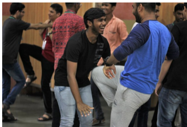
YOGA SESSION AND SELF-DEFENSE WORKSHOP CONDUCTED BY EXPERTS

Following in the footsteps of knowledge and awareness, a disaster management workshop was conducted for the first-year engineering aspirants where they were introduced to several ways of protecting themselves in a serious situation and ways to avoid fatal injuries/accidents.