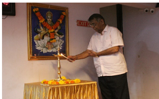
BLESSINGS- LAMP LIGHTING CEREMONY