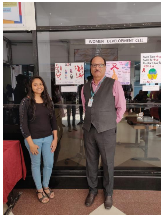
Glimpses from Poster Presentation