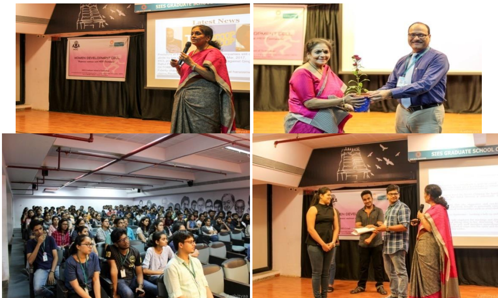
Glimpses from the seminar on POSH

Feedback: All students had appreciated the contents delivered by the resource person.