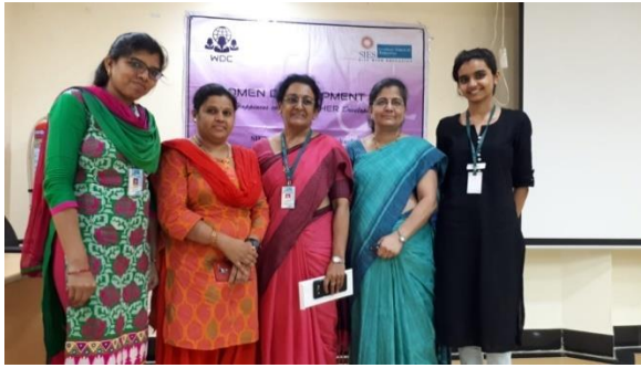
Glimpses from Seminar