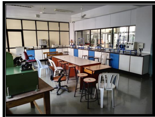
MATERIAL TECHNOLOGY LAB